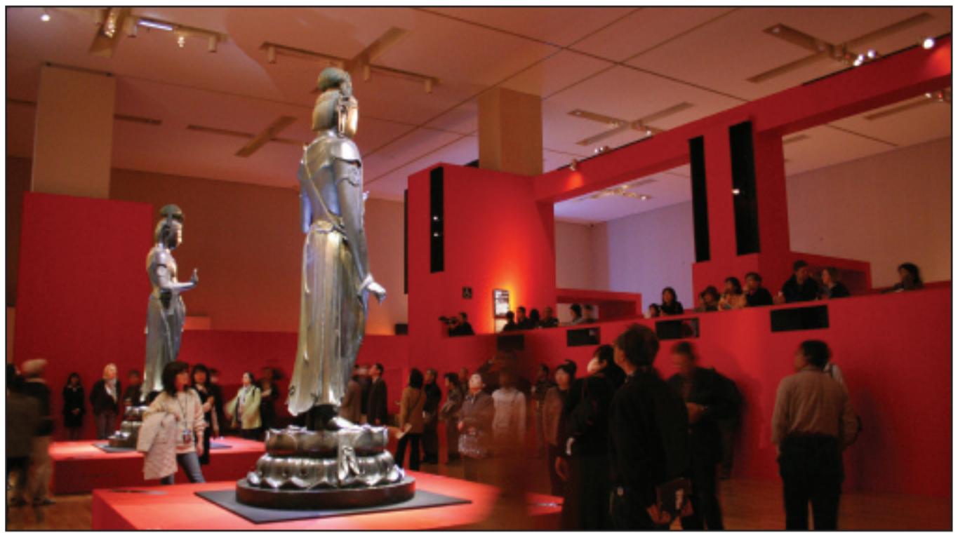
Yakushi-ji Temple Treasures

Meanwhile, some are following a middle line. Tate Britain had a rare year in 2007 with its hugely successful Holbein and